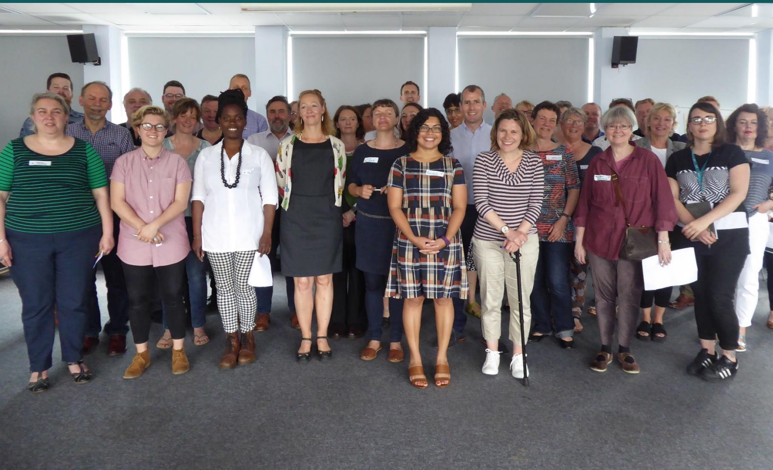
Mentees and Mentors, 2017-18 programme

Connecting charities, volunteers and businesses