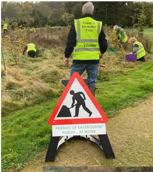
c Friends of Easebourne Parish