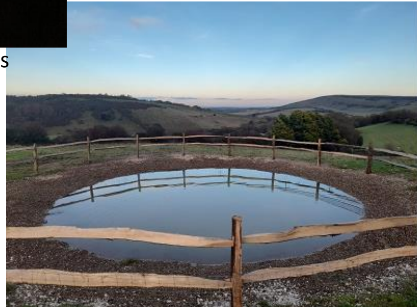
c Gregory Ade