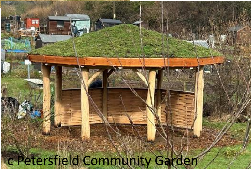
c Petersfield Community Garden