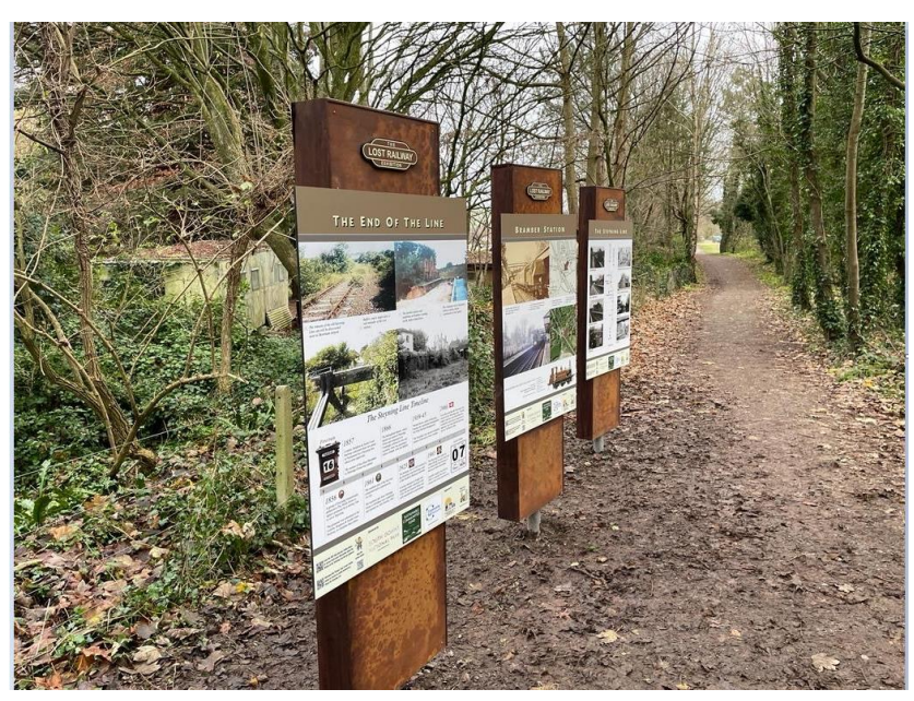
Lost railway project, Steyning.