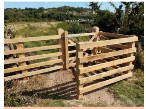
Make it easy for everyone to access the National Park by increasing the network of family friendly walking and cycling routes and encouraging underrepresented people who live near the Park, but seldom use it, to do so