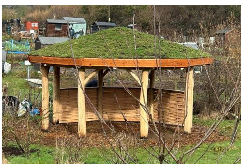
c Petersfield Community Garden

50% match funding for non-profit community projects. Does not fund village halls, church or sports centre refurbishments.