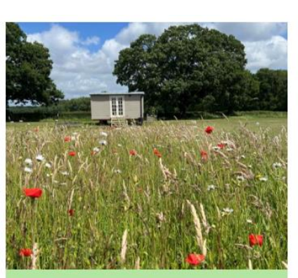
Improve and expand our Grassland, Heathland, Woodland and Wetland which will continue to decline without support.