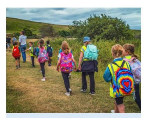
Get more children outside Children spend only half as much time playing outside as their parents did. We want to change that, increasing the recreational time children spend in the South Downs.