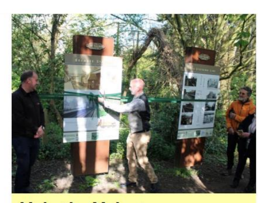
Help the Volunteers, Farmers and Communities who make our National Park – Their time is given freely, but they often lack funds. With a little financial support, we can help their time achieve a lot.